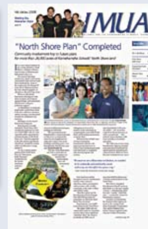
I Mua – Fall 2008