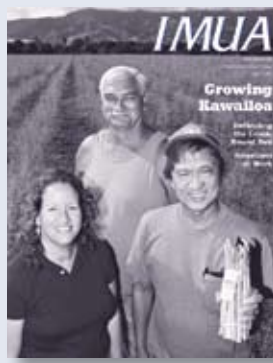
I Mua – March 2005

For more on Kawaiiloa Plantation (March 2005), Kamehameha's North Shore Plan (Fall 2008) and Kamehameha's Strategic Agricultural Plan (Spring 2010), please visit www.ksbe.edu and check out these past issues of I Mua.