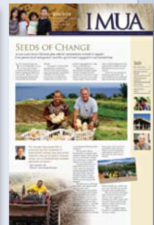
I Mua – Spring 2010