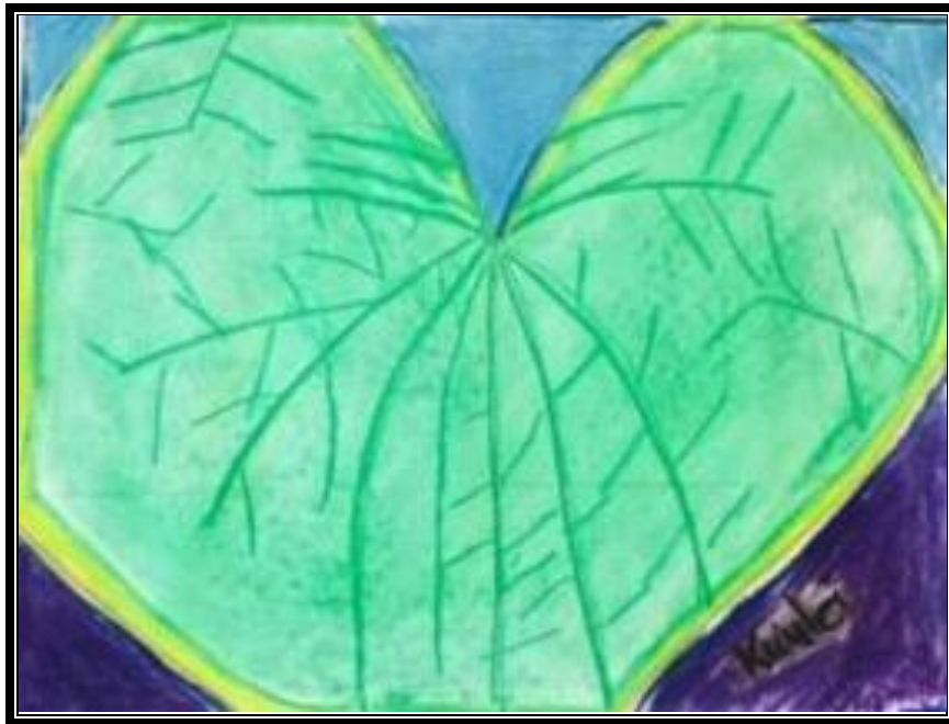
"Olena" by Chandon-Scott Kipi c/o 2027