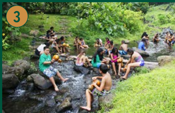
3 Papahana Kuaola