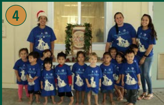
4 Kamehameha Schools Preschool