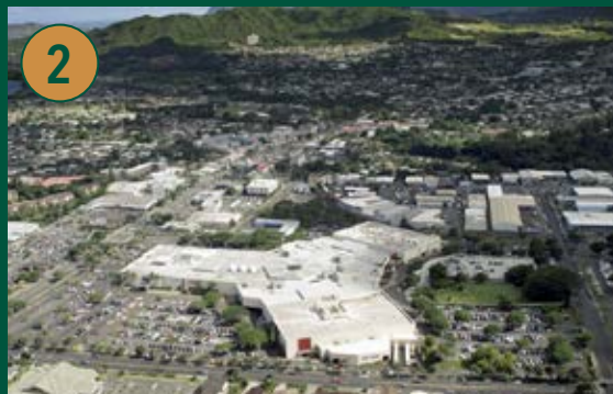
2 Windward Mall