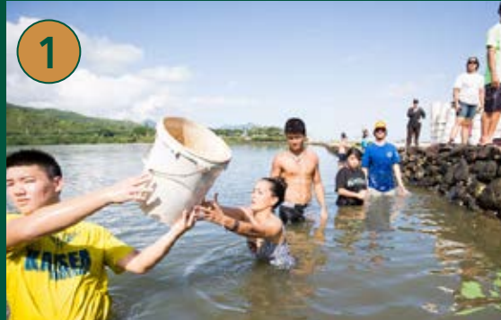
1 Paepae o He'eia