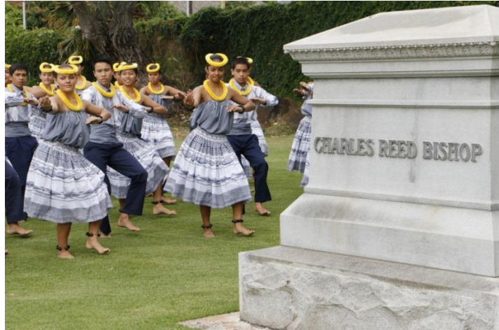
Charles Reed Bishop was laid to rest alongside Pauahi in 1915. A stone monument was later placed next to the Kamehameha tomb to honor Bishop. It was inscribed: "Builder of the State – Friend of Youth – Benefactor of Hawaii."