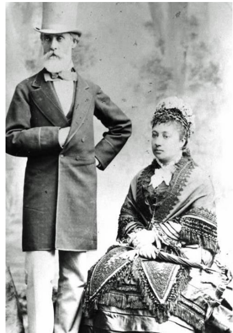
Charles and Pauahi were married in 1850. Through their 34 years of marriage and up until his death in 1915, he steadfastly advanced their shared vision of nurturing the well-being of Native Hawaiians.