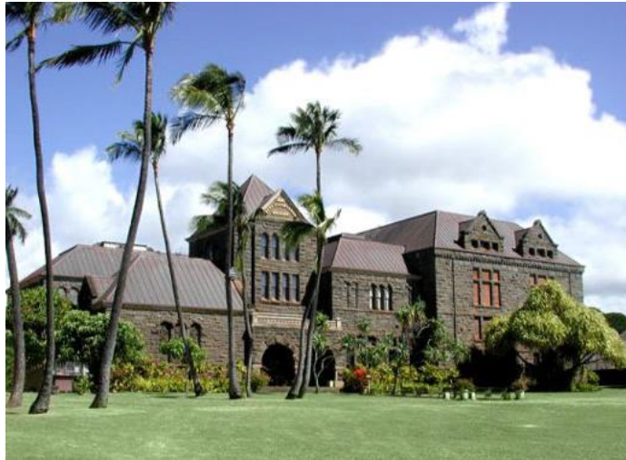
Bishop founded the Bernice Pauahi Bishop Museum in 1889 as an enduring memorial to his wife.

Bishop founded the Bernice Pauahi Bishop Museum in 1889 as an enduring memorial to his wife. Pauahi had inherited many irreplaceable heirlooms from her parents and her cousin Ruth Ke'elikōlani, including feather lei and capes, kāhili, niho palaoa, kapa, lau hala mats, stone and bone implements and calabashes. Queen Emma also willed her priceless antiquities to Bishop, who turned her collection over to the museum.