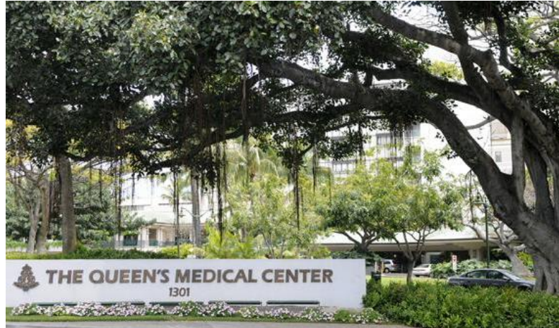
Bishop gave more than $100,000 in financial gifts to The Queen's Hospital, making him the hospital's chief benefactor.

Bishop served on the Board of Trustees from the hospital's inception until his departure from Hawai'i in 1893. Through his trusteeship, which spanned 34 years, he served as treasurer, member and chairman of the Executive Committee, and vice president. Bishop gave more than $100,000 in financial gifts to Queen's Hospital, making him the hospital's chief benefactor.