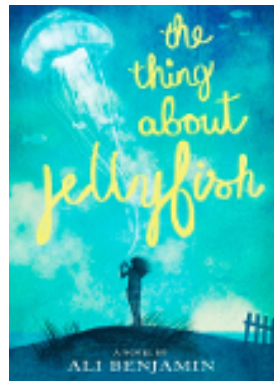
The Thing About Jellyfish by Ali Benjamin