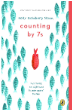
Counting by 7s by Holly Goldberg Sloan

Lexile text measures in band level (700–800L)