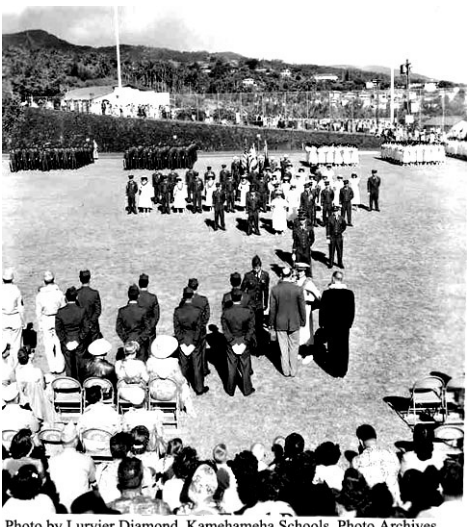
Final Parade, 1954.

We do not stress intellectual treatment of our youngsters at the expense of other aspects of their training. We need athletic instruction. We need dining hall instructions. We need the disciplines of the Military. We need good speech, and good writing, good manners, good poise, good study habits, good self-discipline, good conduct--and a belief in God. When we deal with children in their growing years, we offer them the precept and example of leadership.