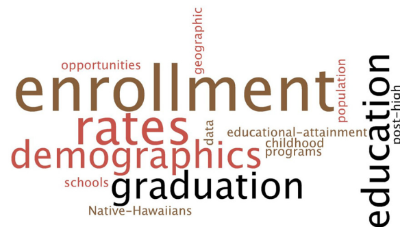
Figure 1 provides a brief description of what types of statistics each report will contain. All data will be reported out for the Native Hawaiian population, at a minimum, but may include other groups as well.

Secondly, the Update Series product line is intended to be a collaborative effort with internal KS stakeholders, who are central to the implementation of the KS Education Strategic Plan (ESP), including: Campus Strategies Group, Public Education Support Division, Community-Based Early Childhood Education Division, and Career & Post-High Counseling Department of the Extension Education Division. In this regard, data gathered by these collaborating groups may occasionally be used.