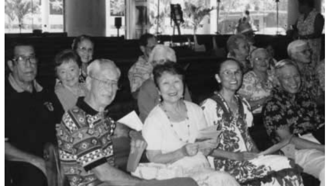
KS '48 classmates at Bishop Memorial Chapel for services in March 2004.