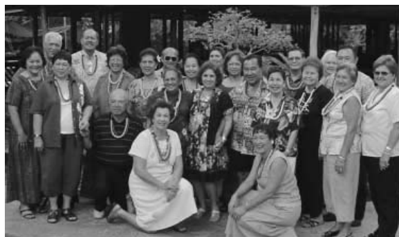
KS '54 at Willow's spring luncheon.