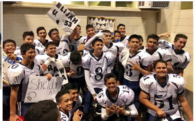
Clockwise from top left: Bowling, JV Football, JV Volleyball & Riflery