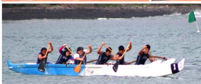
Cross Country, Wrestling and JV Paddling