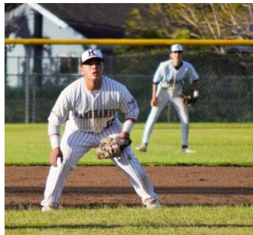
JV Baseball -More pics inside