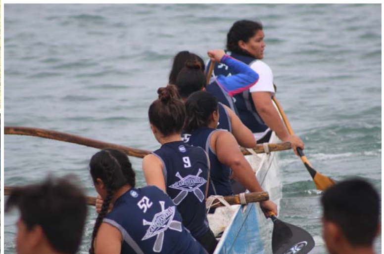
JV Paddling and JV Basketball