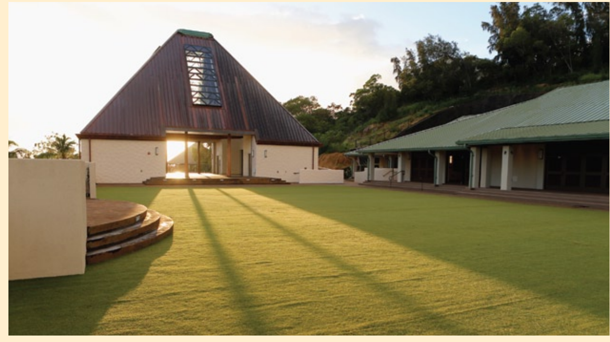
Major construction on the Ka'iwakiloumoku Hawaiian Culture Center, located on the Kamehameha Schools Kapālama campus, was completed in fiscal year 2012. The center is part of the school's $118 million Ke Kupu Mālamalama campus renovation project.

As of June 30, 2012, the overall fair value of the Kamehameha Schools endowment was $9.2 billion, up from $9.06 billion the previous year.