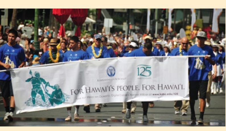
The King Kamehameha Day Parade honored Kamehameha Schools' 125 \mathrm{th} anniversary in June.