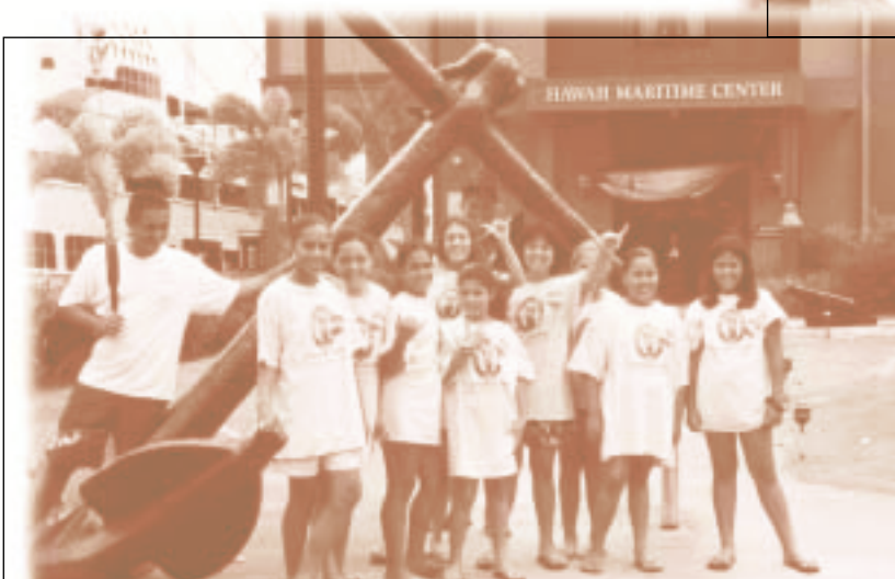
Left – More than 50,000 non-Kamehameha Schools students have enjoyed the summer boarding experience Explorations in the last 36 years. Here, a group takes in a visit to the Hawai‘i Maritime Center.