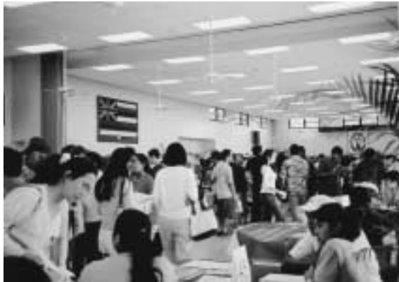
KS Campus College Fair 2002 in December at Kalama Dining Hall.