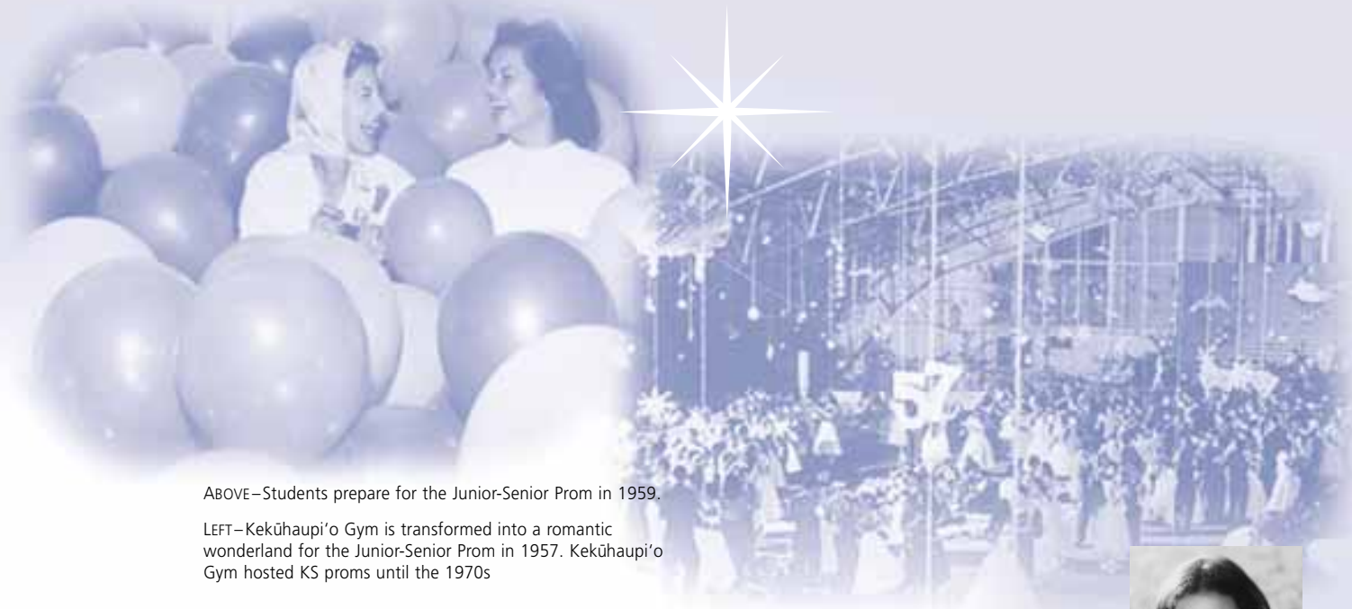
ABOVE—Students prepare for the Junior-Senior Prom in 1959.