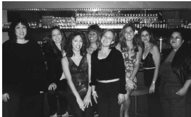
KS '81 fundraisers at Rumours Nightclub.