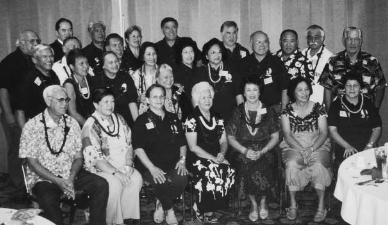
KS '54 enjoys a class banquet in Las Vegas, Nev.