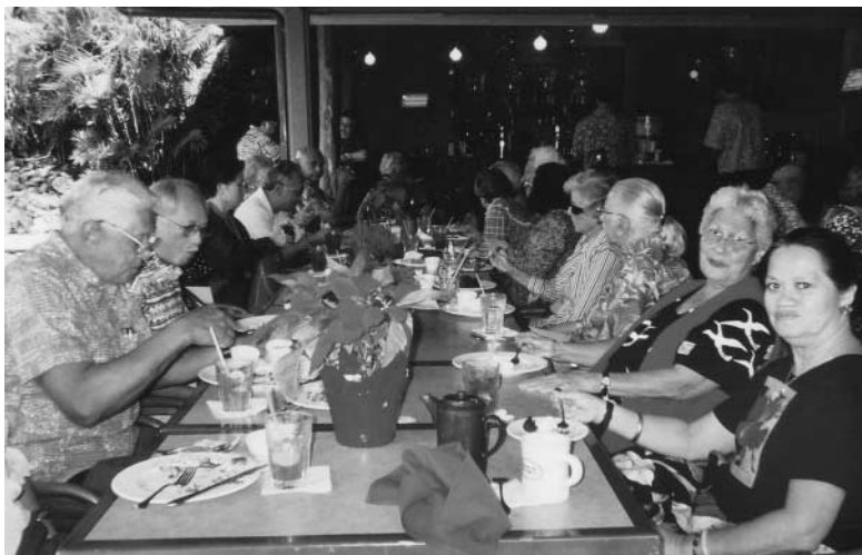
KS '44 classmates enjoy a Christmas luncheon.