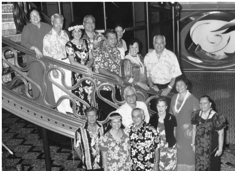
KS '57 class members aboard the cruise ship Carnival Elation.