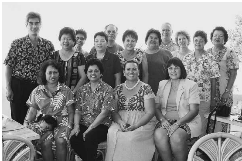
KS '65 Class Planning Committee.