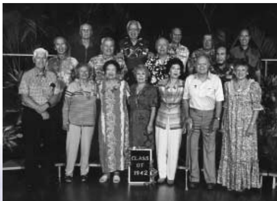
KS Class of 1942

Those who were able to attend activities during the week express a deep and sincere sense of appreciation for the many hands involved in helping to make our stay on campus a most memorable one.