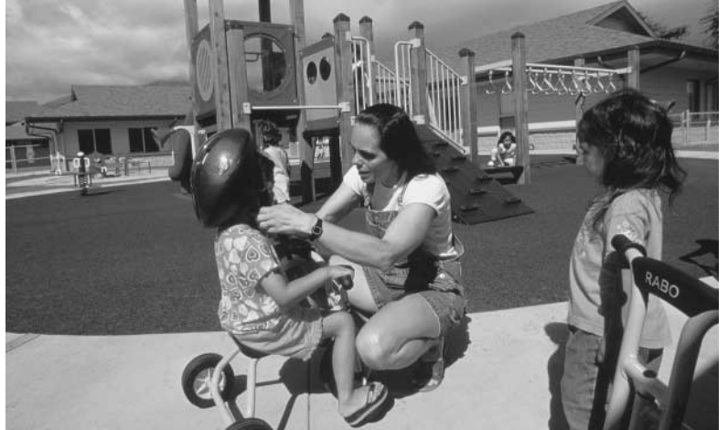
Kamehameha's Paukūkalo Preschool on Maui can serve up to 72 children ages 3 and 4.